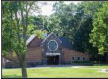
Church of the Nativity 2677 Delsea Drive Franklinville, NJ 08322