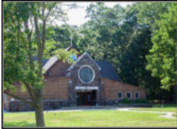
Church of the Nativity 2677 Delsea Drive Franklinville, NJ 08322