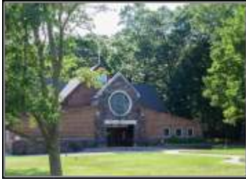
Church of the Nativity 2677 Delsea Drive Franklinville, NJ 08322